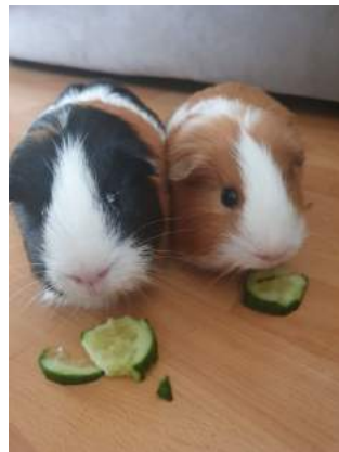
Lucky & Ginger