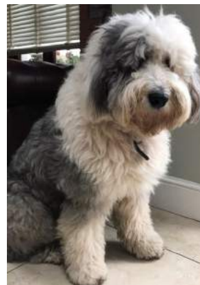
Guinness or 'G'